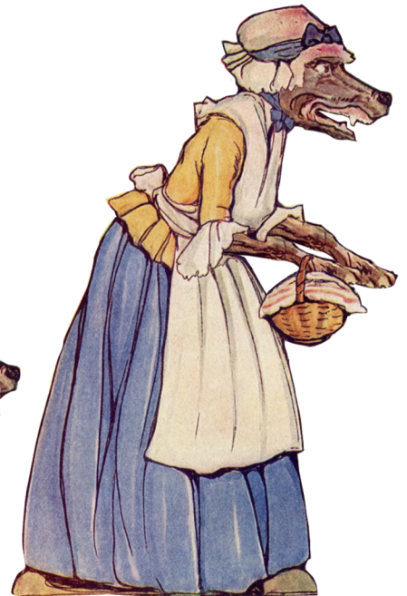
The Wolf in disguise

Get creative! Can you make additional shadow puppets using pictures from magazines or newspapers? Find pictures that will cast a shadow you can easily recognize. Try using items like a music box, toy instruments, crinkly paper, and more to create sound effects!