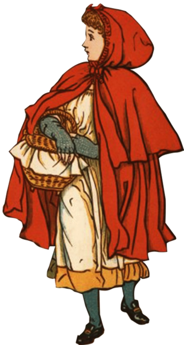
Little Red Riding Hood

Can you use these puppets to retell the story of Little Red Riding Hood ?